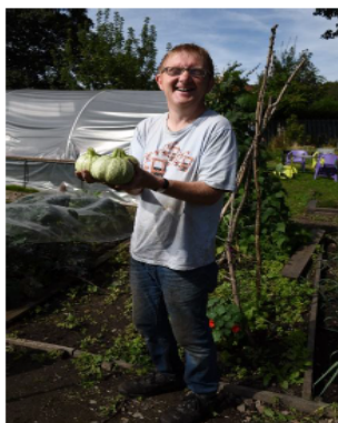
Photograph Dave Wood by Jon Legge

Arena Community Garden Allotment is throwing open its gates to the public offering two exciting afternoon garden sessions at its Heanor Road site in Ilkeston, DE7 8DY.